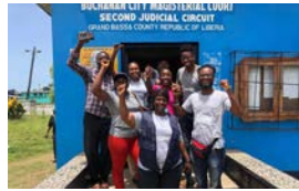
GOD BROUGHT VICTORY & PEACE AFTER A 4 MONTH BOGUS COURT BATTLE